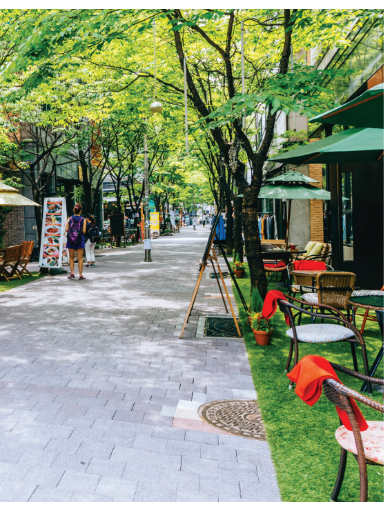
Bojeong-dong cafe street in Yongin, Korea.

The university holds international symposiums and publishes various academic journals, and manages important and specialized research institutes such as the Oriental Study Research Institute, the Information Display Research Institute, the Buried Cultural Property Research Institute and the Special Education Research Institute and the Medical Laser Research Institute etc. | Summer students will study at the Jukjeon campus, which is equipped with modern classroom and student support facilities including newly-built dormitories, a library, gymnasium, performing arts center, recreation areas, tennis court, health center, media center, and student union.