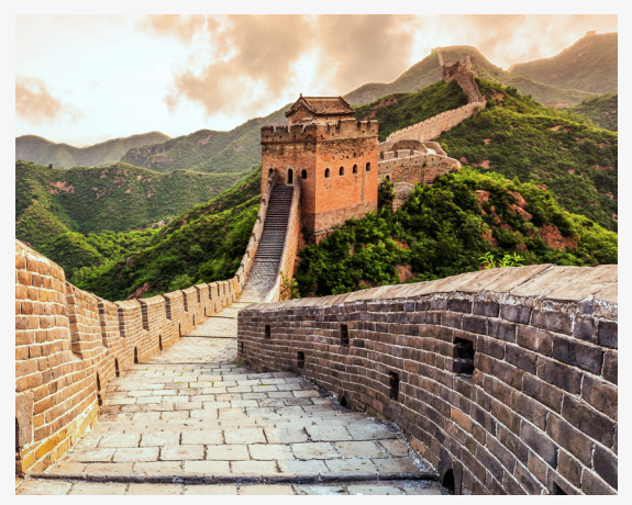
The Great Wall of China.

ImmerQi, is an Australian company operating in China founded in 1992. | Beijing is the historical, political and cultural center of China. The City is home to the country's 'typical' Mandarin pronunciation.