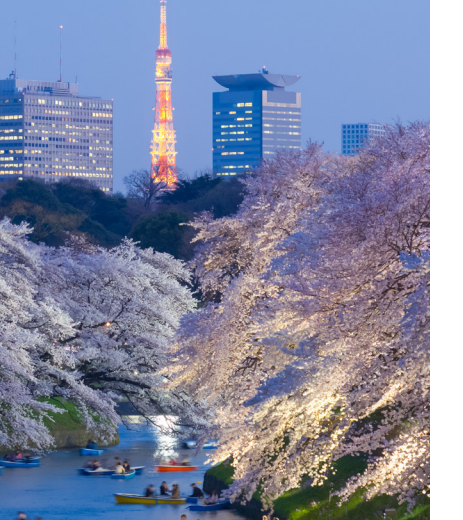
Beautiful sakura cherry blossoms and Tokyo Tower landmark, Tokyo, Japan.