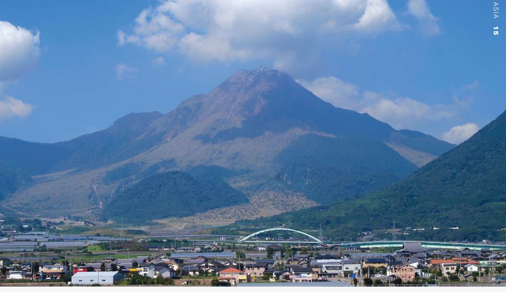
Mt. Unzen, Unzen National Park in Nagasaki, Japan.

■ There are also cafeterias available on campus where students can purchase inexpensive meals.