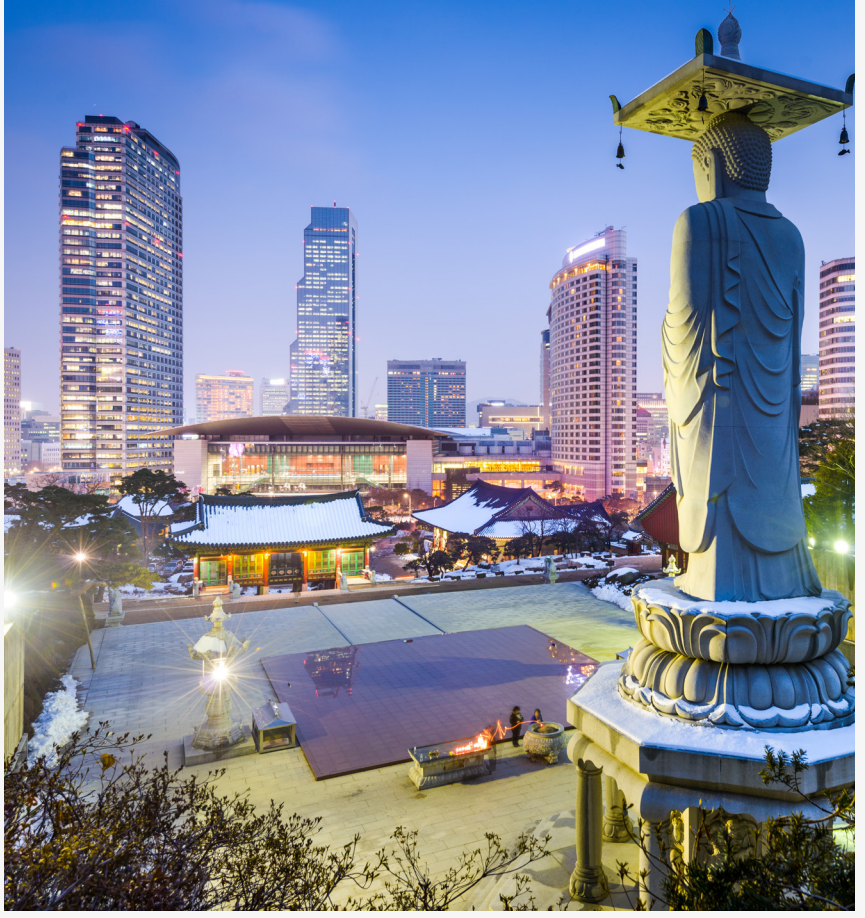
SUNY NEW PALTZ • STUDY ABROAD: ASIA 11

The Seoul National Capital Area is the second largest in the world at 233.7 square miles and an average elevation of just above sea level at 282 feet; because of its very large population.