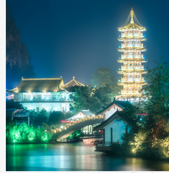
The Sun and Moon Twin Pagodas on Shanhu Lake (Fir Lake) at night in Guilin, Li River and Karst mountains Yangshuo and Xingping, Guangxi Province, China

CLI has offered study abroad experiences to students from 28 countries, representing more than 50 universities. | The CLI staff provide a range of services to students and organize regular activities so that program participants can interact with Chinese students and practice their language skills. | CLI occupies a beautiful five-story building located within a ten-minute walk from GXNU. The center has classroom space, a recreation room, and space for students to hang out. | Compared to other Chinese cities, Guilin is small with a population around 700,000 people. There is very little heavy industry in the region, so the air quality is very good in contrast to the larger metropolises such as Beijing or Shanghai. So, you can breathe easy in Guilin! | Guilin is served by an international airport, so you can travel within and outside China with relative ease.