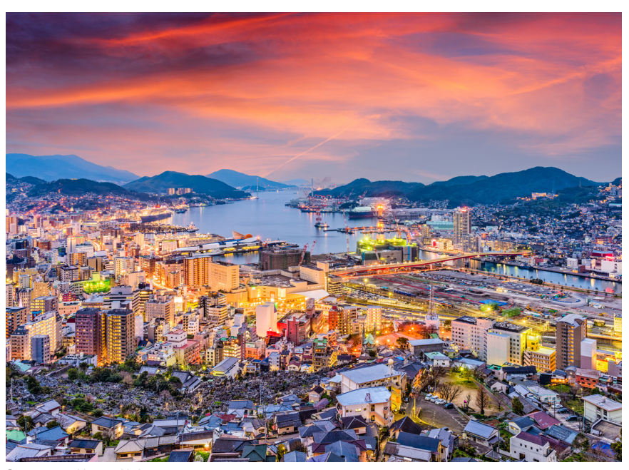
Sunset over Nagasaki, Japan.

Nagasaki University was established in 1949 by incorporating several national institutions, namely, Nagasaki Medical College (including College Hospital and College of Pharmaceutical Sciences), Nagasaki College of Economics, Nagasaki Normal School, Nagasaki Youth Normal School and Nagasaki High School. | Nagasaki bears much significance in Japanese history as the only port open to Westerners during the Tokugawa shogunate and as the site of the second atomic bomb dropping at end of WWII.